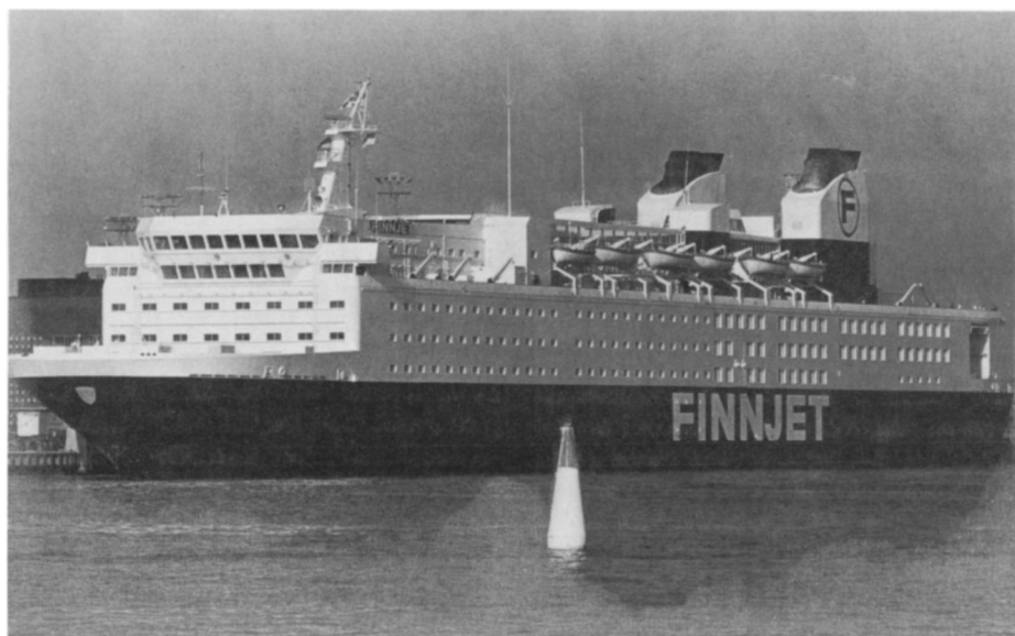
Figure 3. The Finnjet leaving Helsinki harbor.

Canal, originally built for strategic purposes accommodates vessels of 10 000 grt and 8 m draught, shortening the distance between the Baltic and the English Channel by 300 nautical miles. Some 50 million tons of cargo pass through the Kiel Canal and an estimated 125–150 million tons through the straits (6).