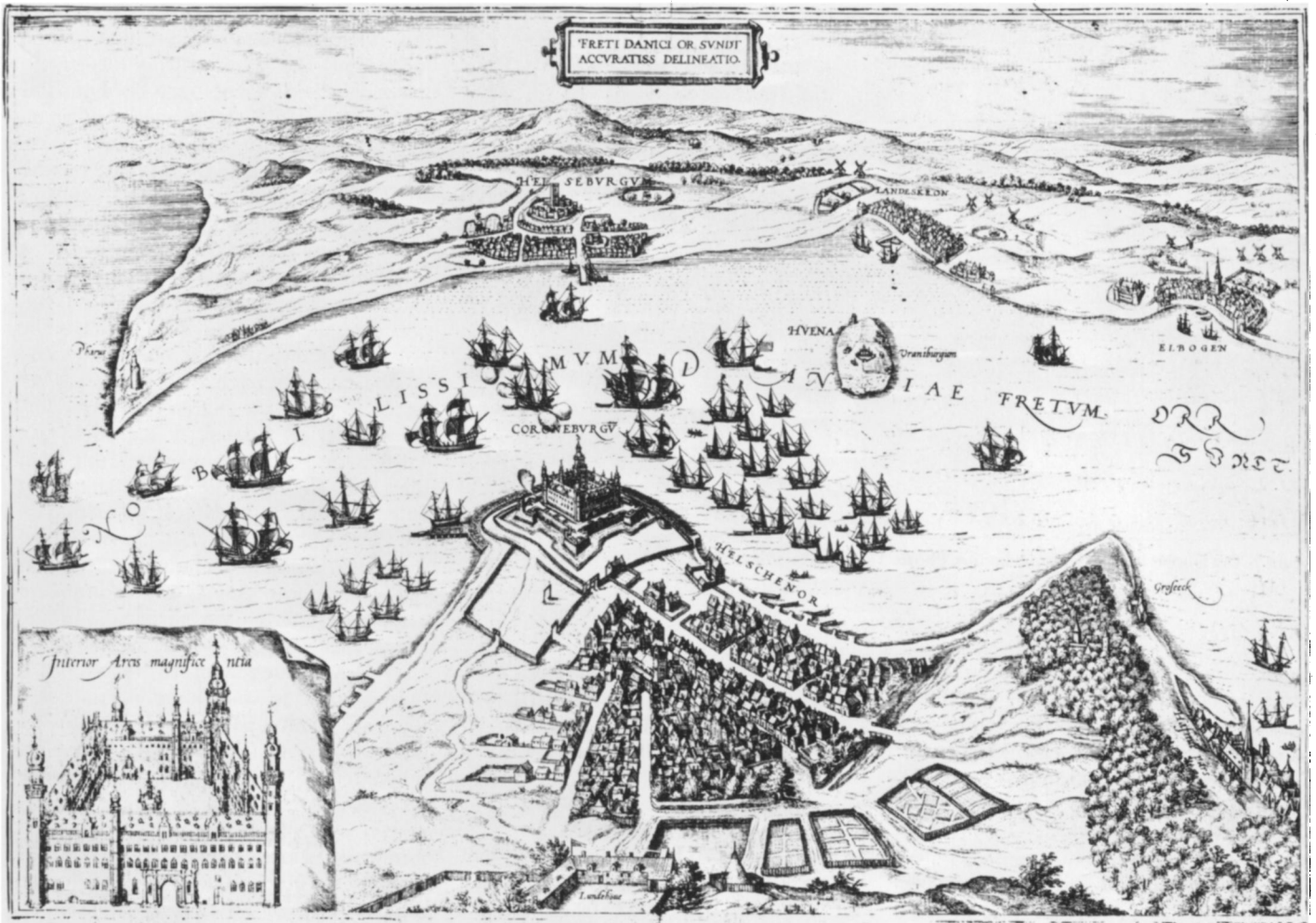
Figure 1. Old map showing the narrow straight separating Helsingør (Denmark) with Helsingborg (Sweden). Kronborg Castle can be seen in the center. Between 1429 and 1857 the Danes collected sound Dues from all ships passing through the Sound.

threshold depth of 13 m. However, currents are strong and a bridge completed in 1935 limits traffic to vessels with less than 33 m clearance. The 17 meters transit-route from Skagen to Gedser, NE through the Great Belt established by the Danish Government, Route T, has its depth restriction between Darss in the GDR and Falster in Denmark, the Darsser Schwelle (the Darss Threshold) through which leads the Kadet Channel. The Inter-Governmental Maritime Consultative Organization (IMCO) has issued recommendations on navigation for vessels over 40 000 dwt or a draught of 13 m or more. Traffic is separated at Sprogø and in the Kadet Channel (6).