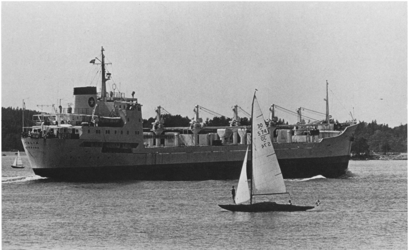
Figure 5. A cargo vessel maneuvers through the Stockholm archipelago near Vaxholm.

wegian port of Narvik; on the Swedish coast there are two ore ports, Luleå and Oxelösund. Stockholm, the leading general cargo port on the east coast and a leading market for oil products, poses special problems with its long and winding harbor entrance through the archipelago (Figure 5). Turku (Åbo), in Finland, has a similar kind of location.