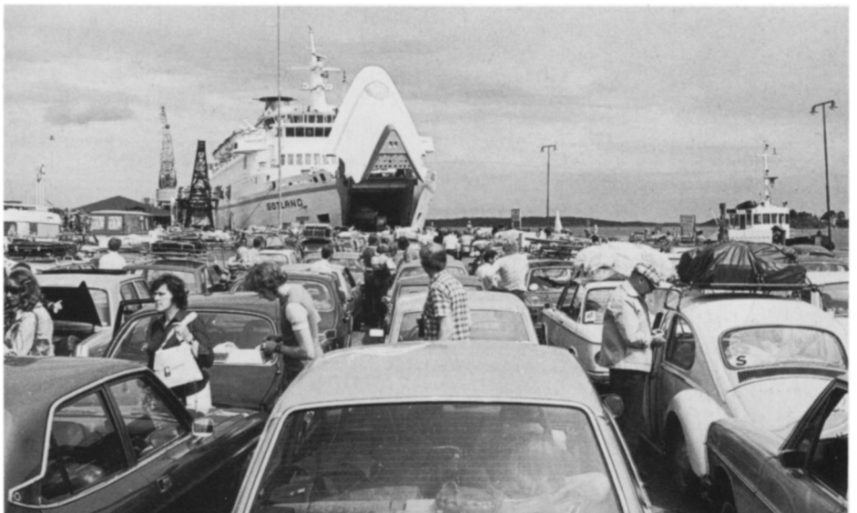
Figure 2. Cars prepare to board the ferry at Nynäshamn (Sweden) bound for the island of Gotland.

ships plus as many fishing vessels are at sea in the Baltic on an average day. Over 100 ships per day pass on either side of Gotland (Figure 2). Some 95 vessels per day enter the Sound from the north and 80 from the south. The Kiel Canal clears 150 vessels a day, the Great Belt 55 and the Little Belt 25. The 100 km-long Kiel