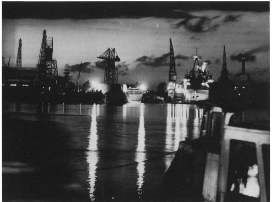
The Neptune Shipyards in Rostock, German Democratic Republic (GDR).

The volume in tons and the work in ton-kilometers accounted for by shipping have increased greatly since the mid-19th century. Ships have increased in size and speed, and have become more specialized, but they have been declining in number. These general trends in world shipping are difficult to quantify for the Baltic Sea. An indication: the tonnage of the Swedish merchant marine, primarily engaged in deep-sea cross-trading, was seven times larger in 1975 than at the turn of the century but it engaged only one-fifth as many vessels. The number of vessels (excluding ferries) in domestic and foreign traffic calling at Swedish ports reached a maximum in the late 1930s. The 437 000 vessels entered and cleared in Swedish ports in 1975 were somewhat fewer than in 1939, but no less than